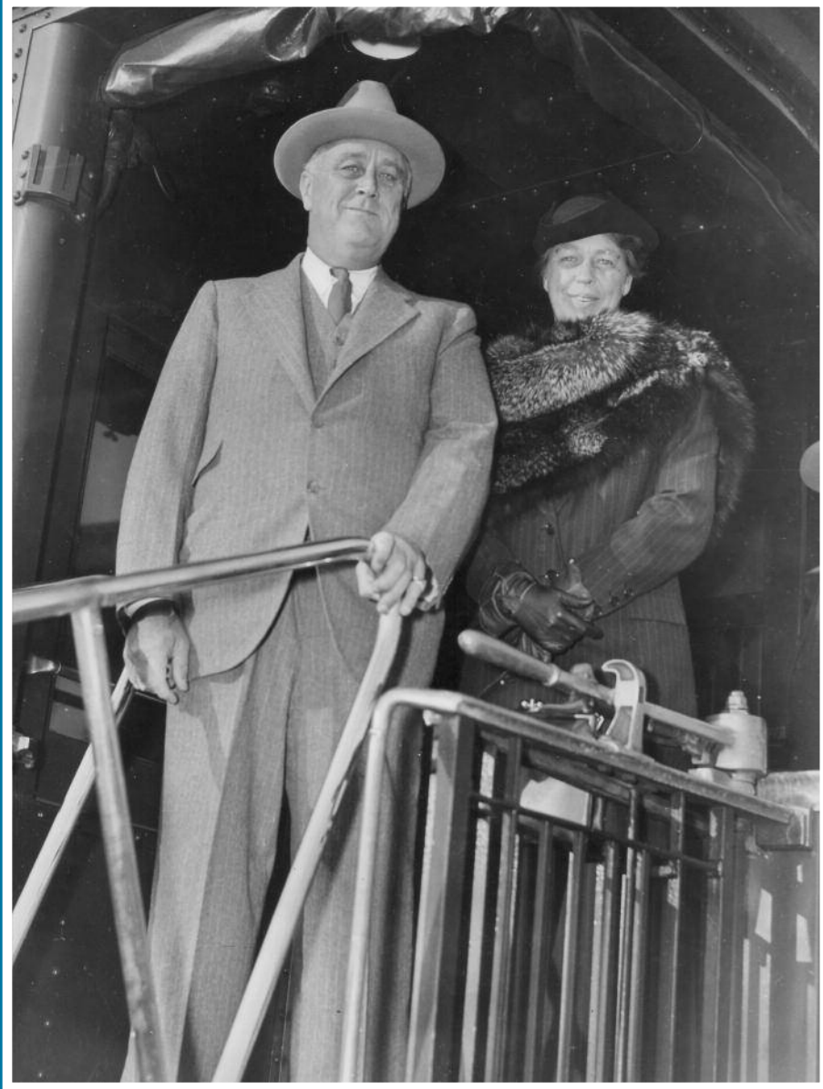
President and Mrs. Roosevelt, pictured upon their arrival by train in Washington, DC, following their trip to Hyde Park, where they voted in the election. November 8, 1935.